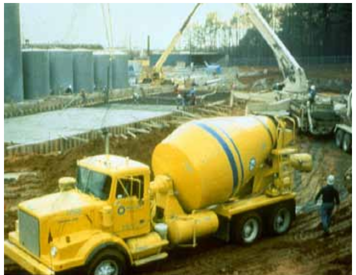
The biggest market for fly ash is the concrete industry.

In cement manufacturing, fly ash is used to replace typical raw feed materials such as limestone, sand, clay, and iron. Because fly ash is largely silica, alumina, and iron (plus calcium in some cases), it can replace a portion of these raw materials, resulting in less mining of natural resources and avoiding the associated carbon footprint of mining equipment and quarrying activities.*