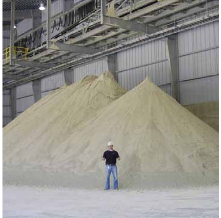
Power plant gypsum is similar in composition to naturally mined gypsum.