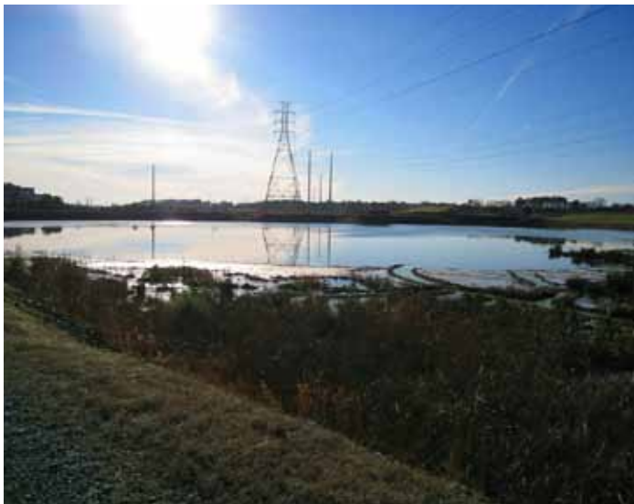
A surface impoundment in Georgia.

An extensive system is in place to meet or exceed all regulations governing CCB management and ensure safe operation. In addition, a significant amount of CCBs from Southern Company's coal-based power generation plants are safely recycled for beneficial use such as concrete production and road building.