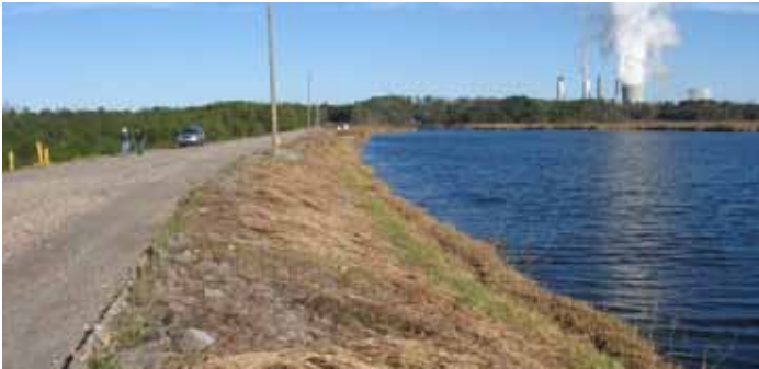
A surface impoundment in Alabama.

EPA followed up these information requests with on-site inspections at a number of plants nationwide, including 14 Southern Company plants. Of those for which EPA has issued final reports , Plant Gorgas in Alabama and Plants Bowen, McDonough, Scherer and Mitchell in Georgia were found to be satisfactory, the highest rating available . Three of four ponds inspected at Plant Branch in Georgia and five of six ponds inspected at Plant Yates in Georgia also were found to be satisfactory . One pond each at Branch and Yates received a fair rating, with minor concerns noted.