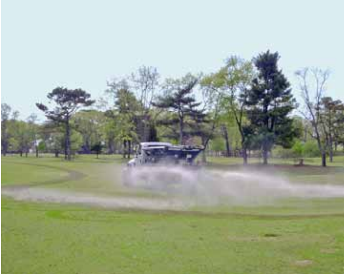
Gypsum, seen here being applied to a golf course, has many agricultural uses as a soil additive.

Southern Company is a recognized leader in energy-related environmental research and development. This commitment to advanced technology extends to CCBs.