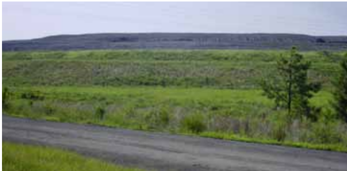
A CCB landfill in Georgia.

Southern Company's operating companies produced 4.9 million tons of ash and about 728,000 tons of gypsum in 2009.* The company and its subsidiaries currently own and operate 22 power plants in four states (Alabama, Florida, Georgia, and Mississippi) with CCB management facilities for fly ash and bottom ash and, in some cases, gypsum.** Power plants may manage ash wet, in ponds, or dry, in landfills.