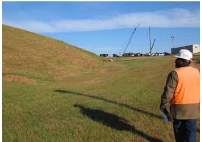
Frequent inspections are a key part of the dam safety program.