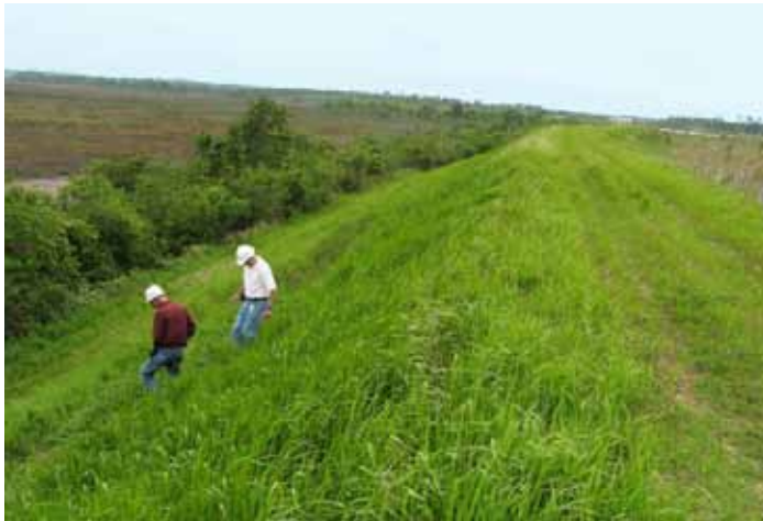
Plant personnel who conduct inspections are trained annually.

A key to safe and secure CCB management is ensuring the integrity of the containment system. Southern Company’s dam safety program is comprehensive and includes inspections, reporting, analysis, regulatory compliance, emergency response, and vegetation control standards.