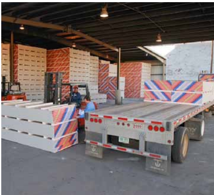
Wallboard manufacturing is a major market for gypsum.

Gypsum represents more than 95 percent of the solids weight in wallboard. Use of synthetic gypsum to replace mined gypsum is an established technology, with scrubber gypsum having advantages such as higher purity and finer particle size. Other environmental and economic benefits include reduced CO 2 emissions compared with mining natural gypsum, and lower raw material and shipping costs.